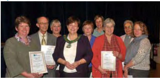
▲ Unsung Heroes of the Vale see page 7