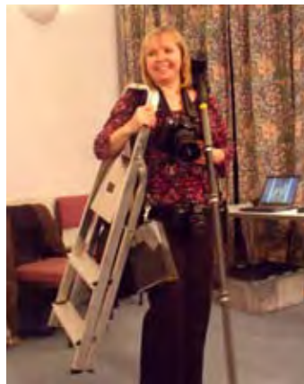
▲ Marcham WI hears about a Fleet Street photographer see page 7