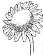
Marcham Moldova Lifeline