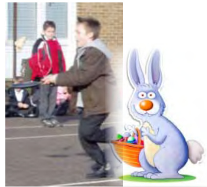
▲ Marcham School's Pancake Races see page 11 for other news from school