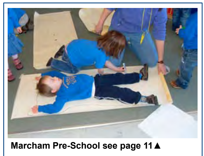
Marcham Pre-School see page 11 ▲

Details of events may change after publication, please check with the relevant organisers before attending events.