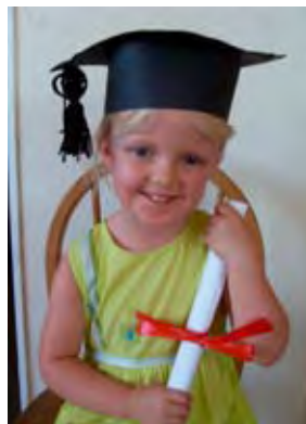
◀ Graduation at Pre-School see page 13