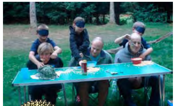
▼ “Feeding Time”