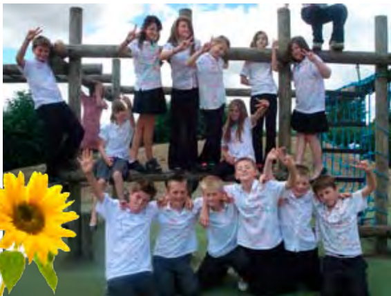
▲ Year 6 say “Goodbye Marcham and Hello Larkmead”