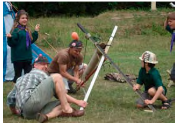
▲ “Testing the Mortar”