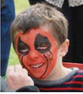
▲ A Right Royal Tea Party see page 7 ▲