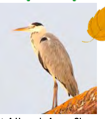
▲ A Heron in Anson Close see page 5