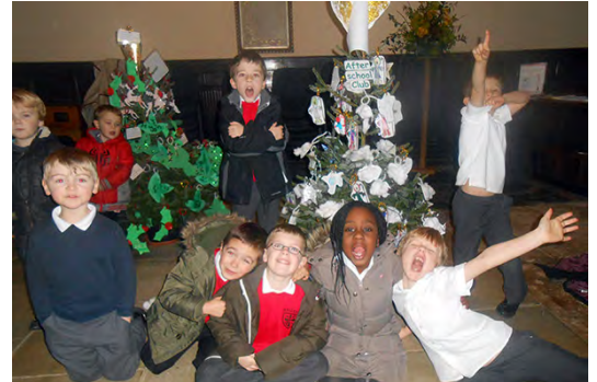
▲ Little Angels enjoying the festivities see page 13