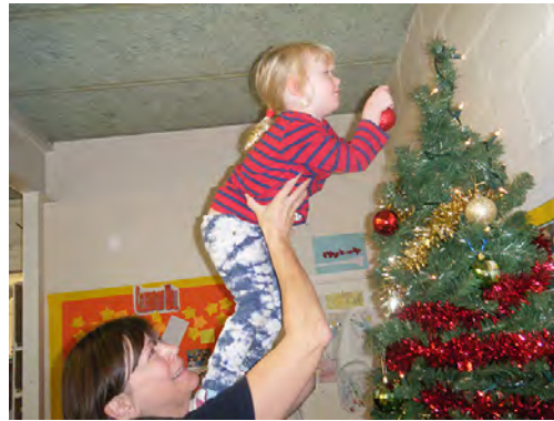
◀ Pre-school putting the fairy on the tree! See page 13

Don't forget the online Village Diary ▼ www.madnews.co.uk/diary To get an event included email editor@madnews.co.uk with the title, date, time, contact details and a short description