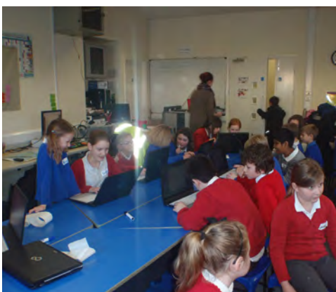
St Francis School