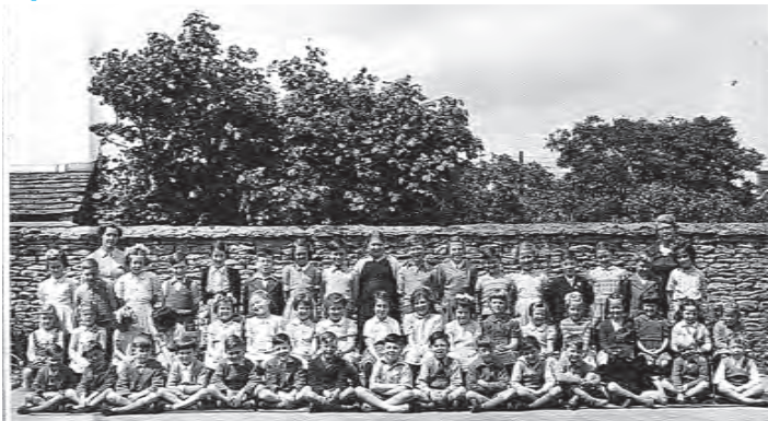
▲ Marcham School Reunion see page 5 ▲