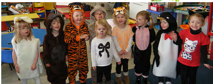
▲ Pre-School: World Book Day