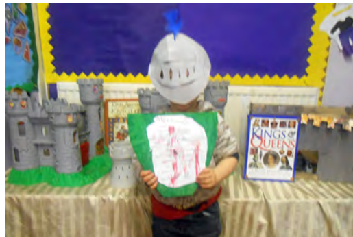
▲ A Knight of the Little Angels