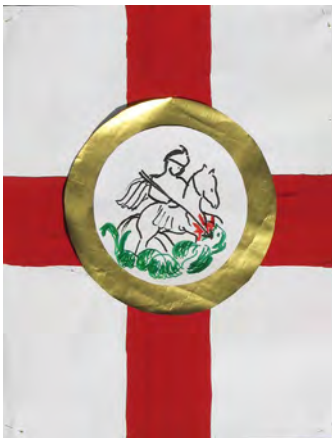
▲ St George's Day banner