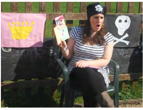
Easter Ahoy at Little Angels!▶ see page 13

May 2014 Vol: 36 No: 5 READ & RECYCLE! FREE