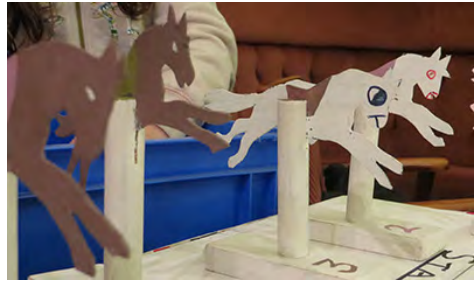
▲ Horse Racing Table-top Style! see page 7