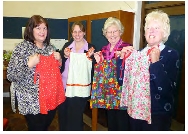
Marcham WI "Dress a Girl Around the World" see page 9