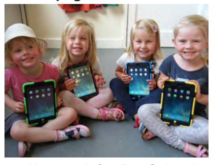
▲ New tech for Pre School see page 17