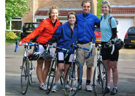
▲ They Did It!! From Lands End to John O'Groats in aid of Vasculitis UK see July MADNews