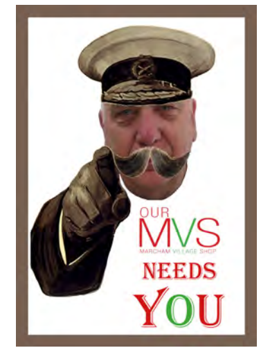
▲ Can you spare a few hours a week to keep the shop open? See page 7