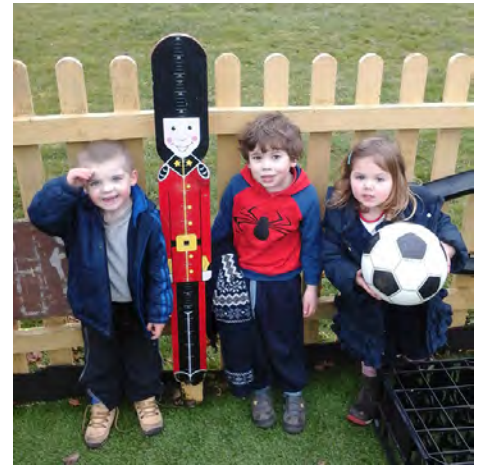
▲ Little Angels – snow and soldiers see page 15 ▲