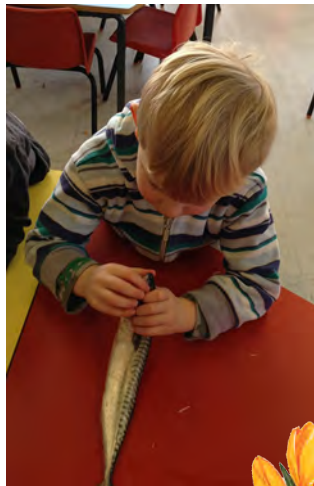
◀▲ Pre-School look at fish see page 15