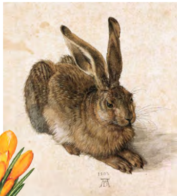
▼ Durer's Young Hare: the MAD March Issue!