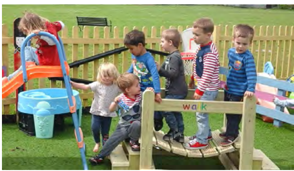
▲ The Baby Clinic and Wobbly Bridge at Little Angels see page 13