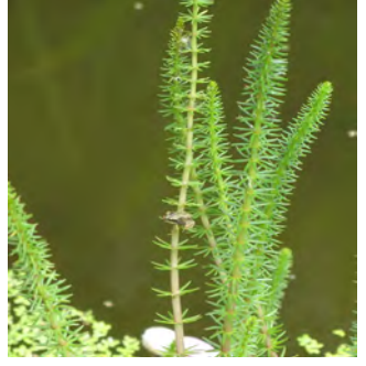
▲ June is the month for tiny frogs