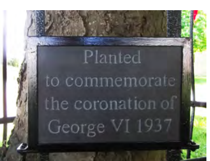
▲ Marcham celebrates the coronation tree see page 5 ▲