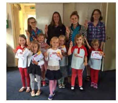
▲ Rainbows appear in Marcham see page 13 ▲