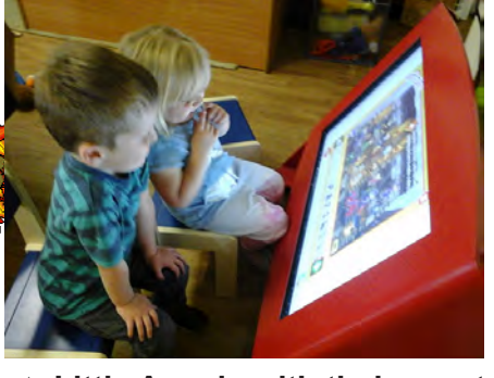
Little Angels with their new tech see page 13