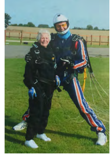
▲ Trish does it again! see page 9

■ Have you lost your keys? Come to Marcham Village Shop to see if they are there!