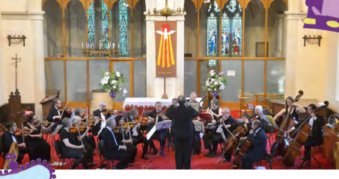
▲ ISIS Chamber Orchestra page 7

▲ Look out for your invitation to Q90B celebrations page 9