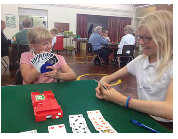
Bridge at School page 17