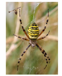
Wasp spider page 11