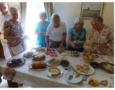
▲ WI Tea Party page 7 ▲ Pre-School page 17