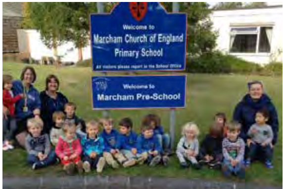
▲ PreSchool gets a sign! page 17