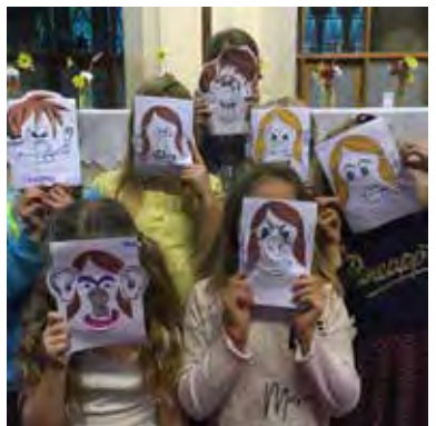
▲ Friday Club's Funny Faces