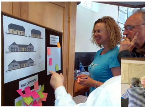
Exhibition for the new community facilities page 5 ▶