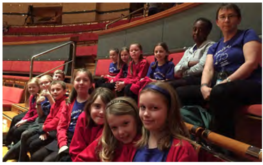
Marcham School at Birmingham Symphony Hall page 13