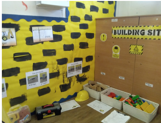
▲ Little Angel project managers and engineers ▶ checking the building site on Anson Field see page 11