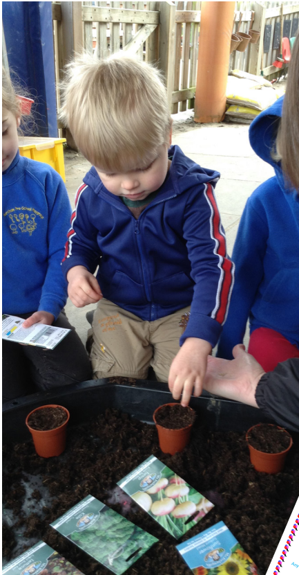
▲ Marcham Pre-school waiting for new shoots to appear see page 11 ▶ Pre-school's 50th birthday party see page 20