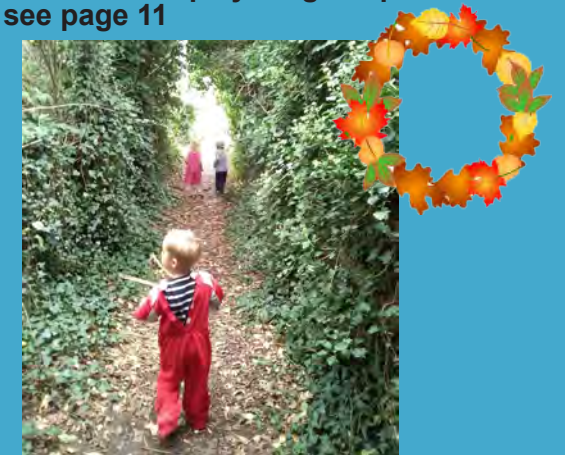
▲ Little Angels walking around Marcham see page 11