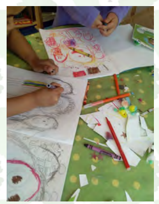
Little Angels in the tunnel and drawing away their worries! see page 11