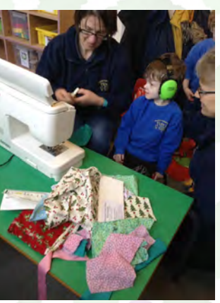
▲ Pre-school get stitching see page 11