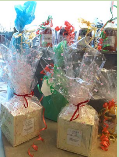
Mothering Sunday gifts all wrapped up at Marcham Village Shop see page 5