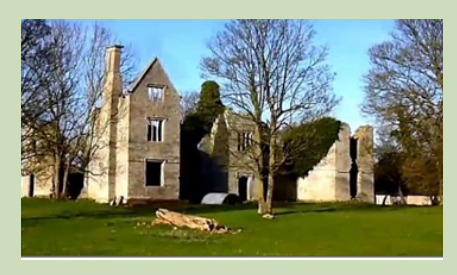
▲ Marcham Society Lecture: The Lost Villages of Oxfordshire see page 7