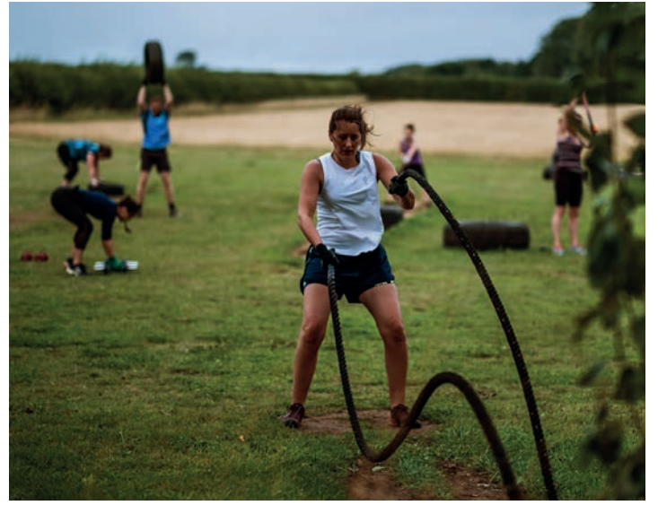
OUTDOOR GROUP EXERCISE CLASSES, YOGA & PERSONAL TRAINING