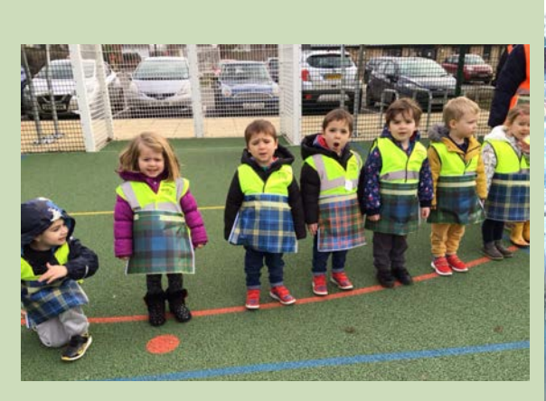
▲ Marcham PreSchool go Tartan for the Highland Games see page 13 Mothering Sunday gifts