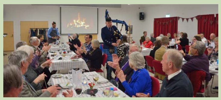
▲ Burns Night Supper at Marcham Centre see page 9