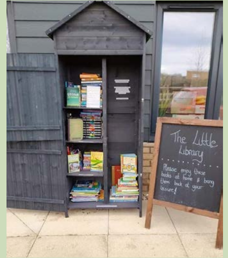
▲ Little Angels: a library for all and a garden reading room for the children see page 13