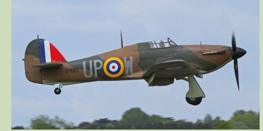
▲ The Airshow is back, tickets on sale now see page 5