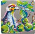
"It's so nice to meet such fabulous new people." Liz, Poole