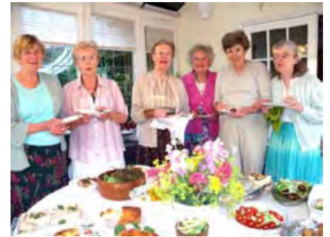
▲ Marcham WI at their Garden Party in June see page 9