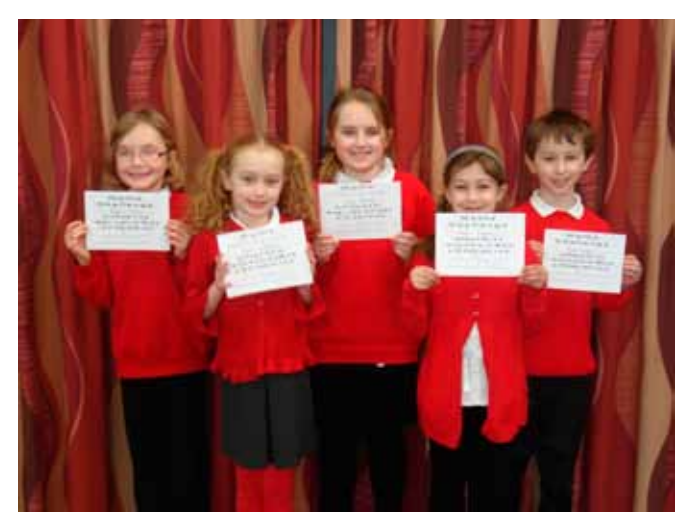
▲ Maths fun at Marcham School see page 13