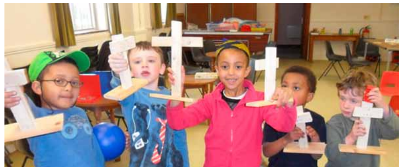
▲ Little Angels with Easter crosses see page 13