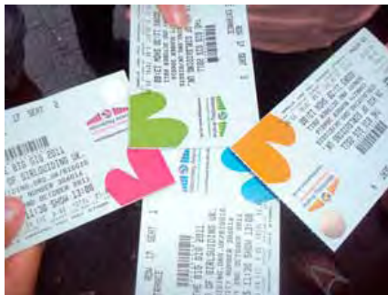
Tickets for The Big Gig

I found the concert really fun and entertaining. There were amazing acts like; Ed Sheeran, Olly Murs, Pixie Lott, Wanted and many more. We had to meet at school at 9:30, then drive to the station where we got a train to London. When we got to London we went straight to Wembley Arena, where we got our seats and enjoyed the amazing atmosphere.