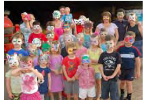
▲ Marcham Masks see page 11