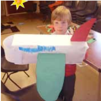
▲ Little Angels Paper Models see page 15