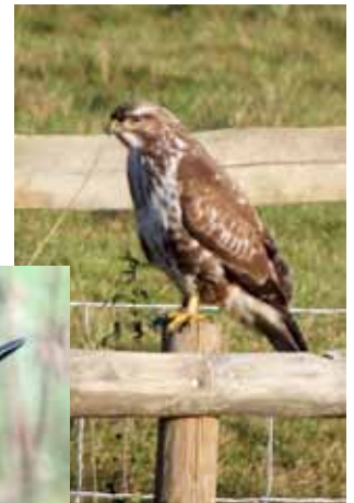
◀▲ Marcham visitors: Kingfisher and Buzzard