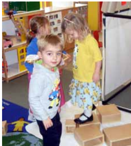
▲ PreSchool see page 15