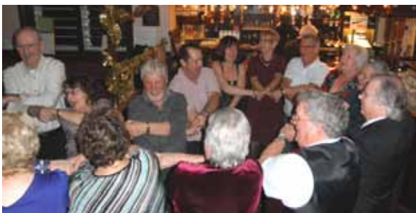
▲ New Year in the Ex-Servicemen's Club see page 13