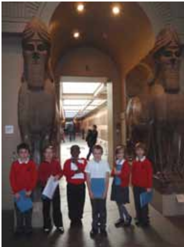
▲ A Trip to the British Museum see page 15