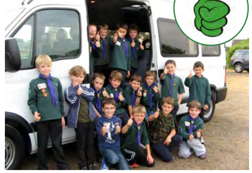
▲ THUMBS UP for our new minibus see page 3