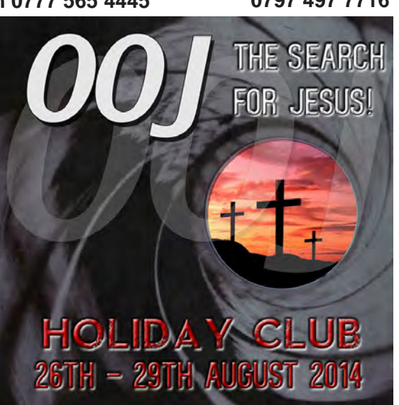
▲ All Saints' Holiday Club