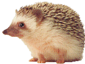
▲ Please don't be too tidy in the garden! see page 7