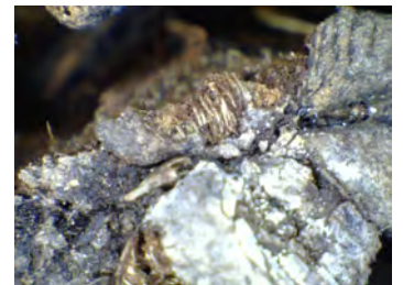
◀ Pre-School under the microscope! see page 15