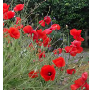
Lest We Forget 9th November Wreath Laying