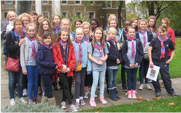
▲ The Guides go to London see page 15