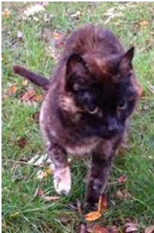
▲ Do you know this cat found in Haines Court? see page 5