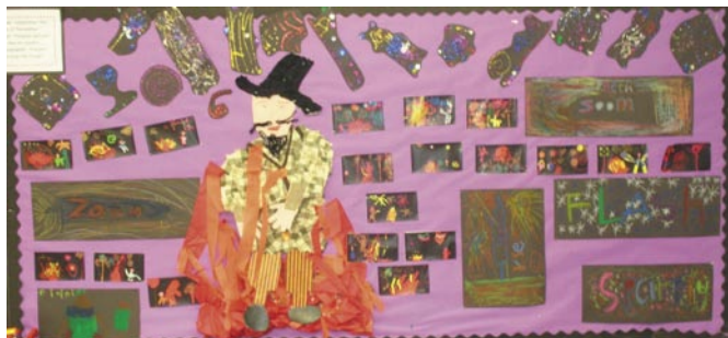
▲ Anson Class found out why and how we remember 5th November see page 13