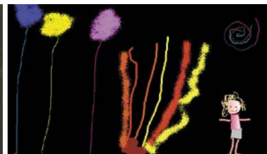
Fireworks by Beth ▲