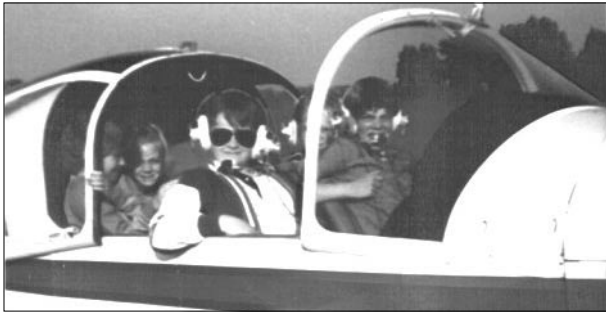
MI8 on the trail of baddies in Yellow Peril