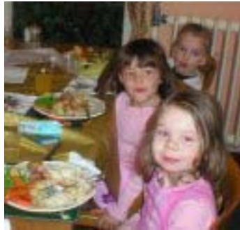
Thanks for a fantastic feast Denman College