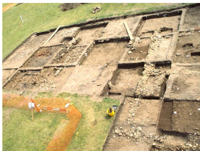
Excavation of the shops tabernae

ARCHAEOLOGY DAY - SUNDAY 24TH JULY when there will be guided tours and other attractions. You will also have a chance to see the dig on TIME TEAM live broadcasts on THURSDAY 7TH and SATURDAY 9TH JULY – we are one of nine sites that will be featured on the Channel 4 programme. (For more information do a Google search for Big Roman Dig: there is an opportunity to volunteer to dig!). We are delighted to announce that we have just heard that The Vale and Ridgeway Trust has been awarded a Local Heritage Initiative grant for a new initiative 'The Trendles Project: Exploring Marcham's Past'. This grant is to help us investigate and promote the heritage of the Trendles site, in particular by involving the local community in participating in the dig in 2005 and 2006: we will be able to produce much more written and visual information, give more lectures and workshops, visit more schools, and support the excavation of a 'People's Trench' to give hands-on archaeological experience to local people.