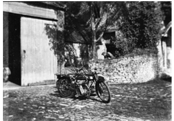
▲ Where is this? Can you identify this bike, house or garage? If yes, call Sheila Dunford on 391439

Visit the Dig! 6 – 26 July 9.30am – 4pm closed Saturdays Fun for all the family see page 11