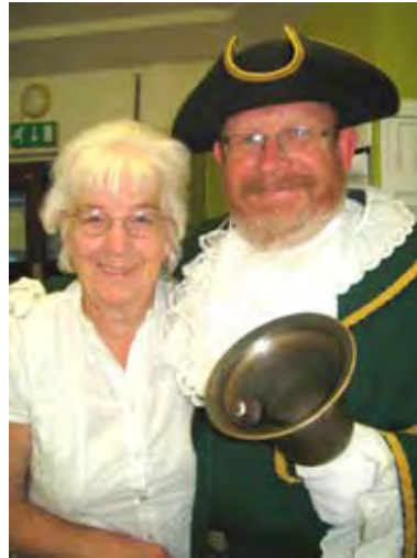
▲ Oyez at Marcham WI see page 9