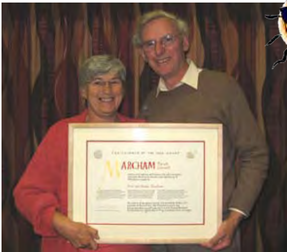
▲ Marcham Parishioners of the Year see page 5 ▲