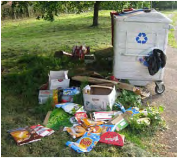
▲ Marcham Shame see Parish Council News page 3