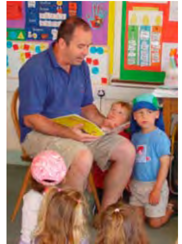
▲ Pre-school celebrates Fathers' Day! see page 11