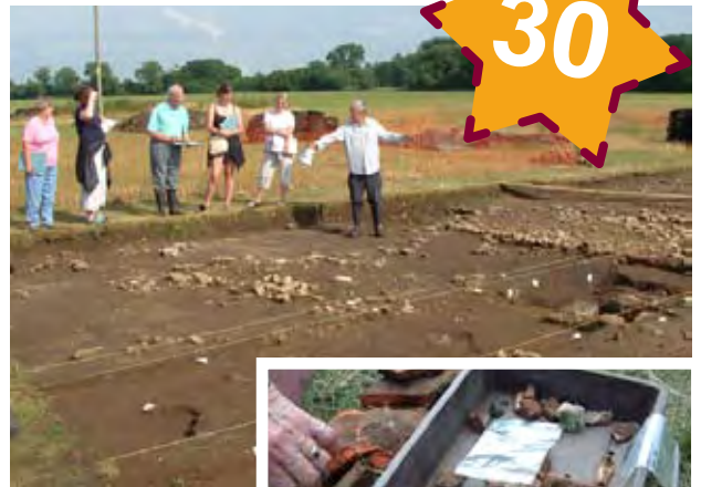
▲ The Dig