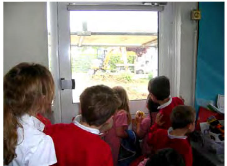
▲ Duffield Class, Marcham School watching the building works see page 11