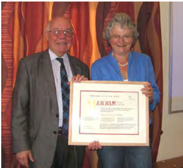
▲ Marcham Parishioners of the Year 2009 see page 7