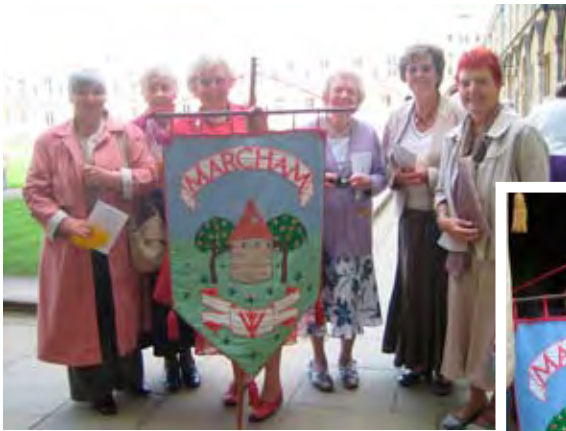
▲ Marcham WI celebrate ninety years of OFWI