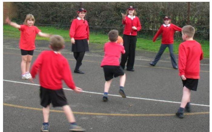
▲ Test driving Play-Leader's new games see page 13