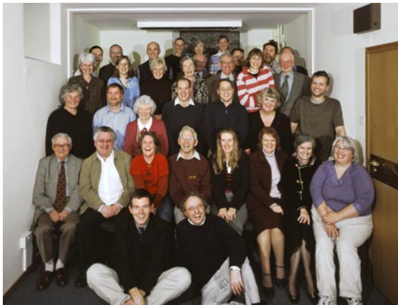
15 years on – see page 11