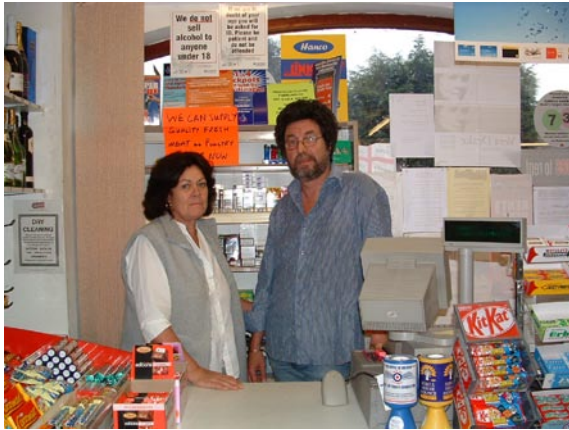
10 years behind the counter – see page 17