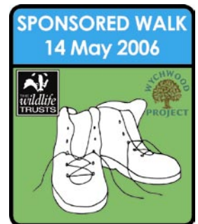
▲ Sponsored walking. See page 15