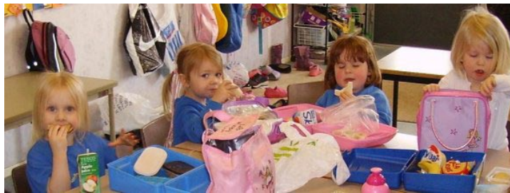
▼ Some of the children at the Hluvukani Day Care Centre surrounded by jumpers see page 11