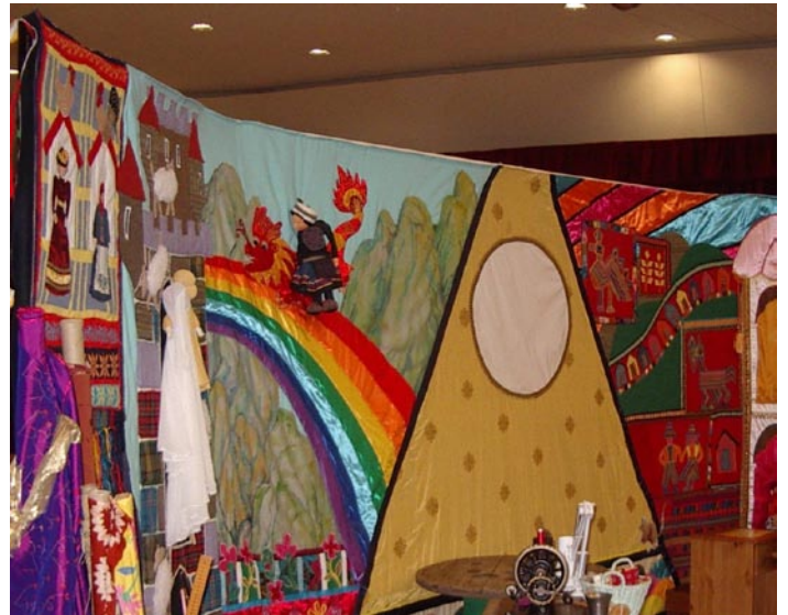
▲ The Story Cloth at Marcham School see page 15