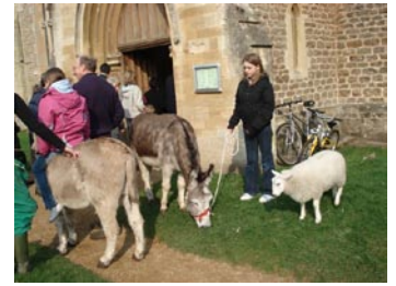
▲ Palm Sunday saw two donkeys, Moses and Aaron (and their friend, Lamb) visit All Saints Church