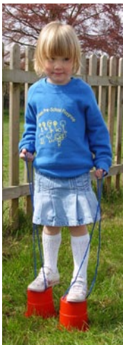
▲ The Litter Muncher ▲ Flowerpot Girl Egg Champion ▶ see page 15