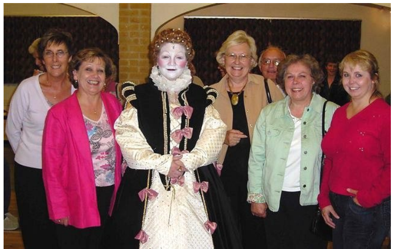
▲ Queen Elizabeth the First joins WI see page 9