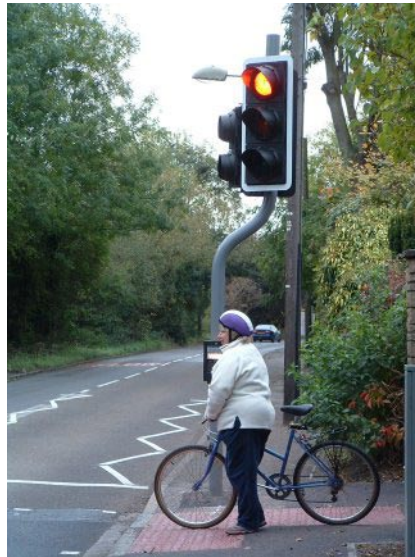
▲ Why did the cyclist cross the road? Our new crossing helps a cyclist to get to the cycle lane safely see page 3