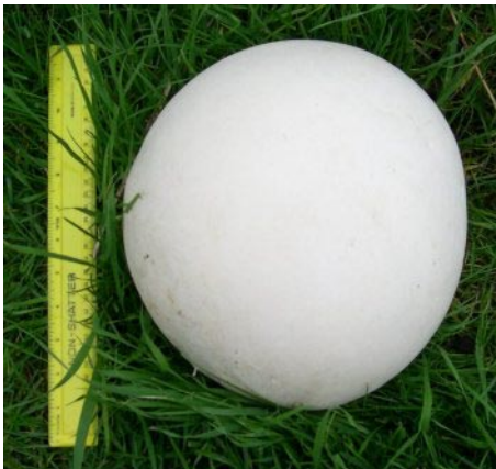
▲ Giant Puffball found at Manor Farm 4lb 7oz/2.02kg destined for soup!