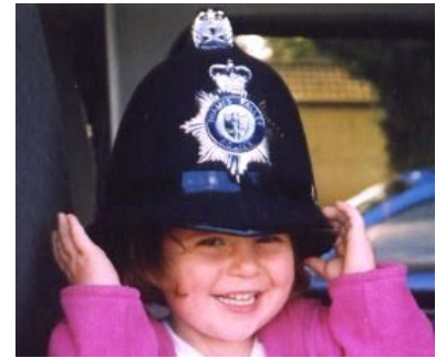
▲ Marcham Pre-school unveils new uniforms see page 13