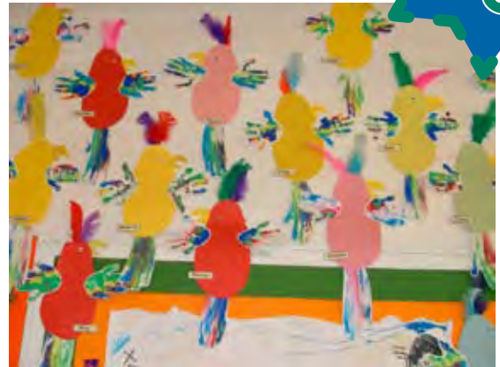
▲ Pre-school Parrots page 13