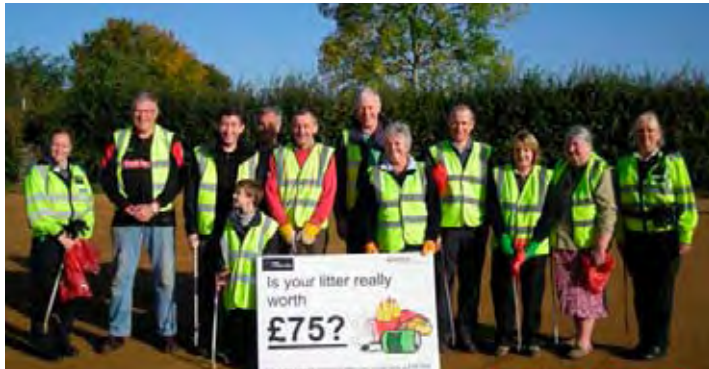
▲ Marcham Litter Blitz page 7