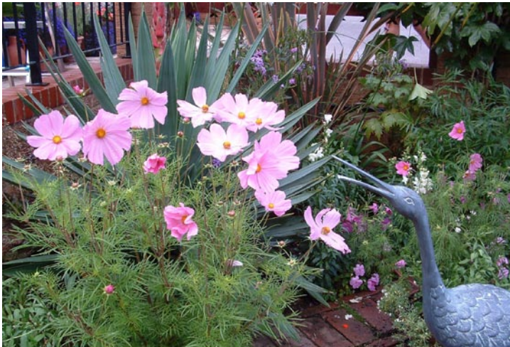
▲ Garden competition winners see page 3 ▶