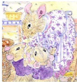
▲ Whose house? see page 17