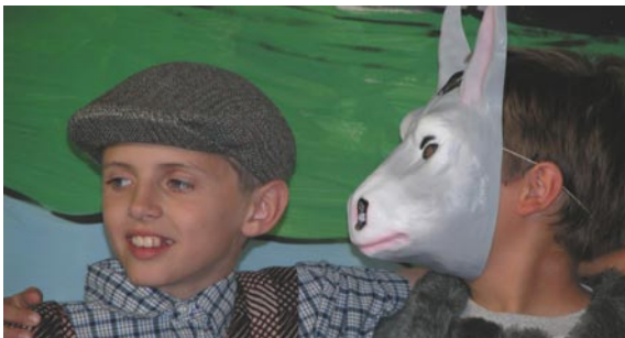
▲ Puss in Boots at the school page 13