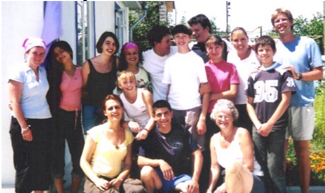
▲ Visiting Moldova see All Saints' Church page