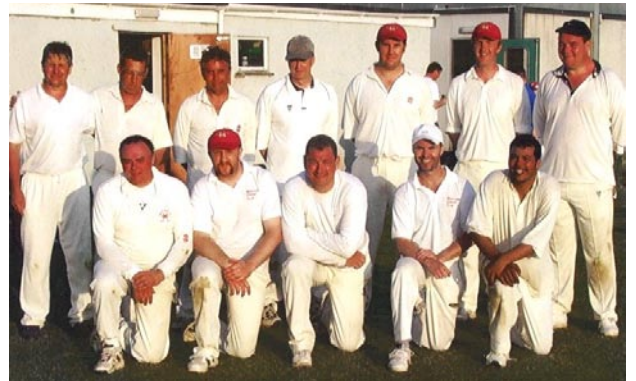
▲ Winners of the 2006 10-10 Tournament see page 9 for a full cricket report