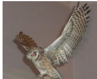
American Burrowing Owl ( Athene cucularia )