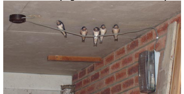
▲ At home with the swallows see page 3