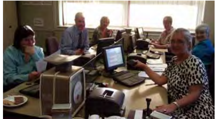
▲ The first six volunteers training to serve in the Post Office see page 7

Official Opening 16 November 3 – 3.30pm For more details see page 7... Come and Support Marcham's Shop