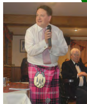
◀ Burns Night see page 11