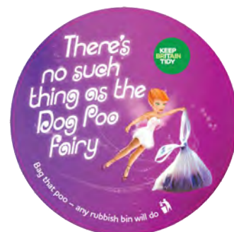
▲ see page 5

Don't forget to "Spring Forward" and put your clocks on by 1 hour 24/25 March