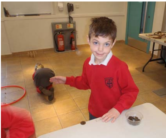
▲ Marcham School's Trip to Woodstock Museum page 15