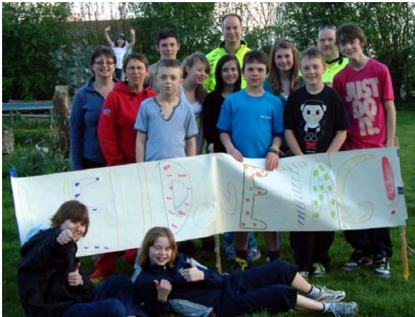
▲ TAG's Triathlon Success see page 19