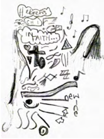
▲ New Wine by Alicia Davies see page 13