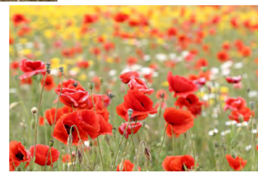
▲ Lest we forget see page 13