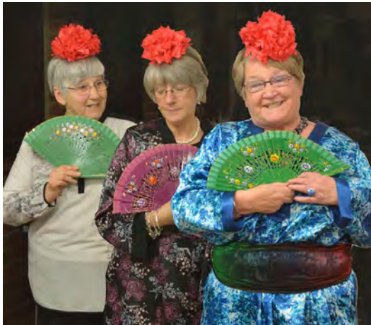
◀ Three little maids from school!