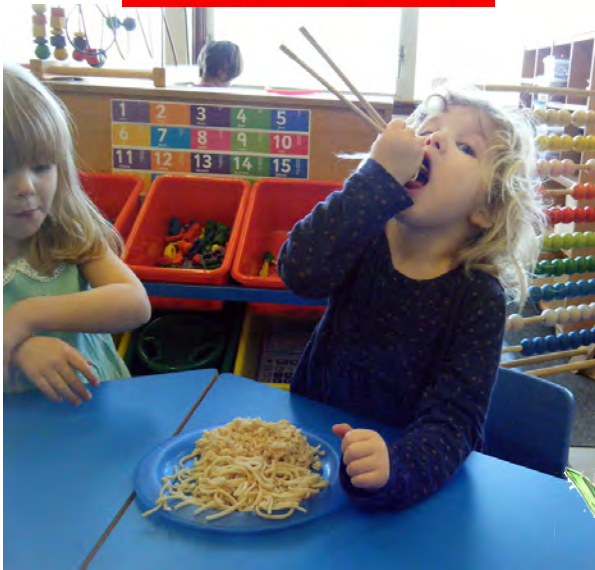
▲ Pre-School celebrate the Year of the Horse see page 13