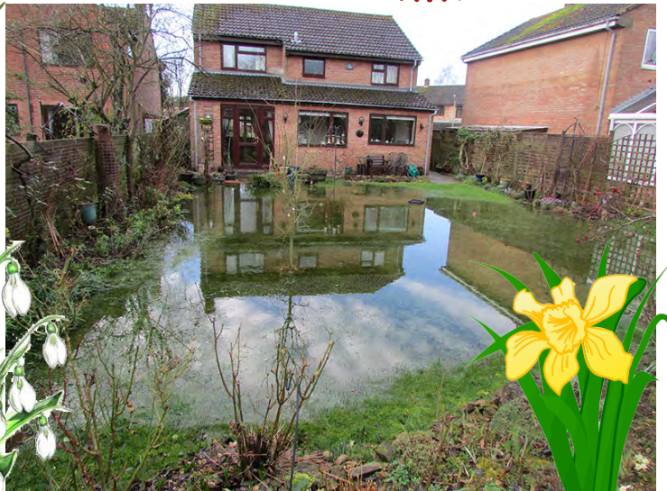
▲ Flooding in Marcham see letters page 3