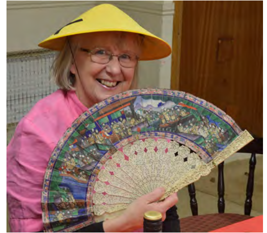
Entering into the spirit ▶

▲ 1st February: MSSSC transformed for the Chinese New Year see page 7 ▲